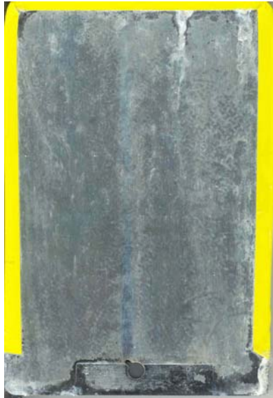
2P, 120 °F, 5 min