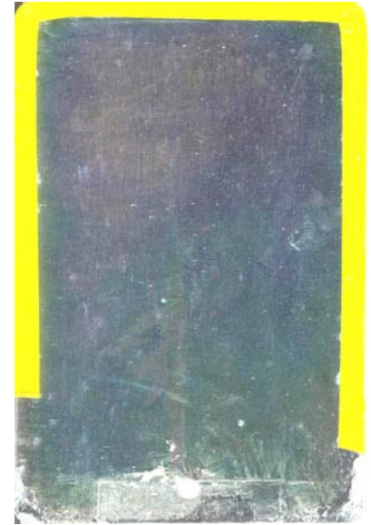
Commercial Cr (VI)