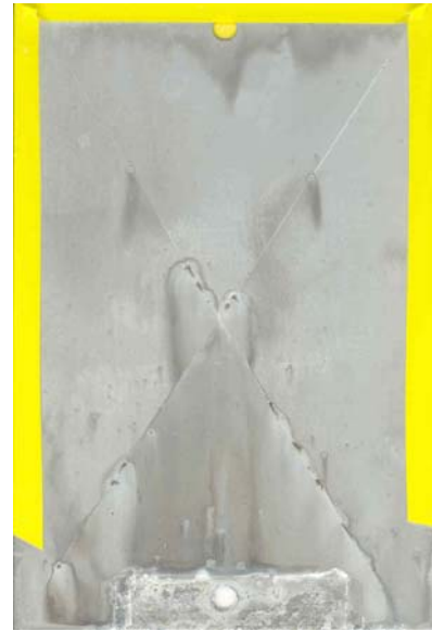
Factory Applied 5S, RT, 10 min Peened 158 days