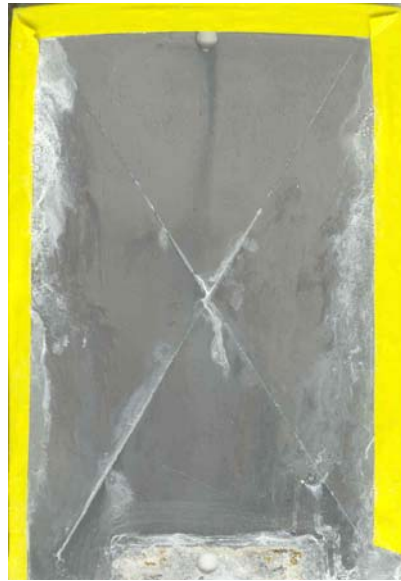
NCP, RT, 10 min Activated Not peened 131 days