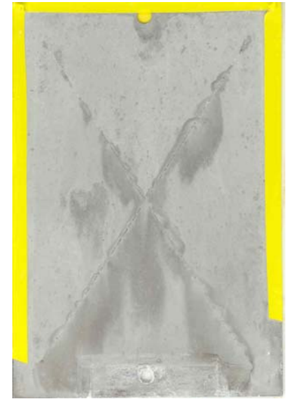
Commercial Cr (VI) Peened 158 days