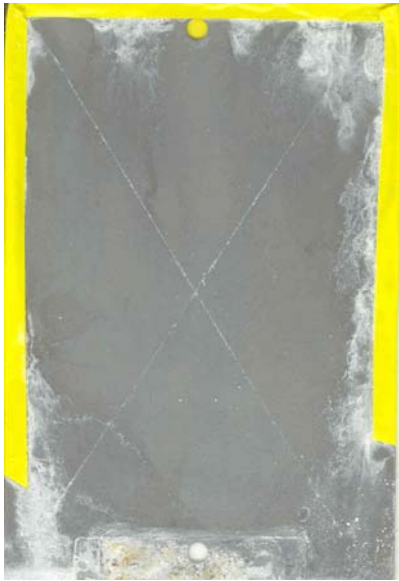
5S, RT, 10 min Activated Not peened 158 days