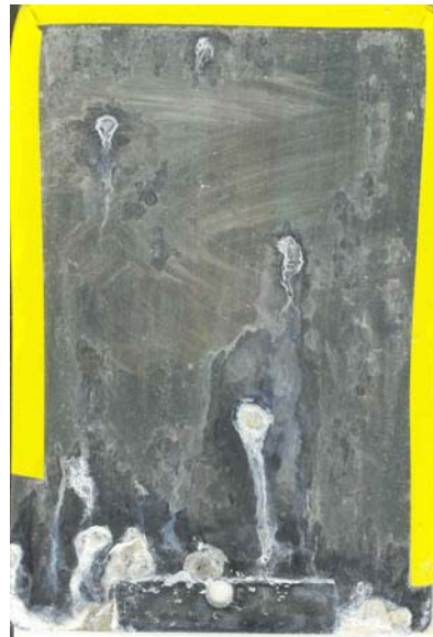
Commercial Cr (III) 25 days